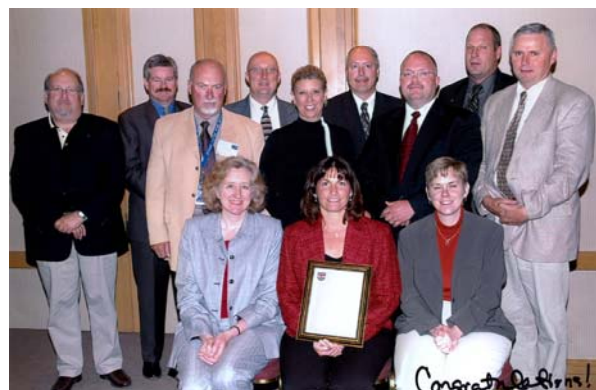
South Milwaukee Police Department