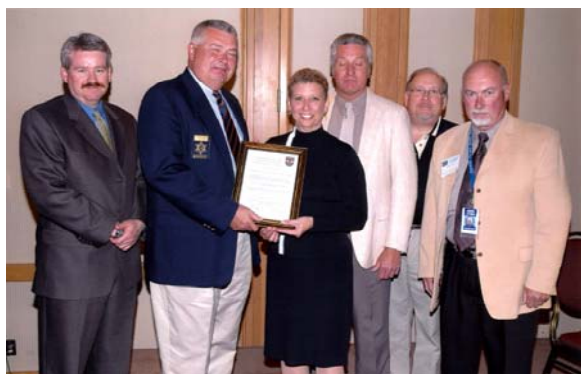
Waukesha County Sheriff's Department