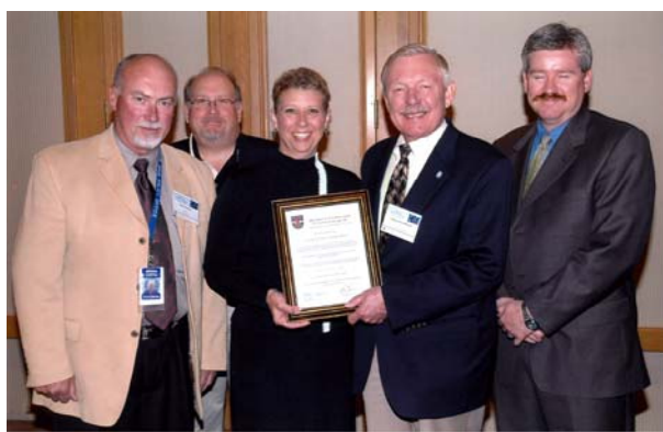
La Crosse Police Department

The Wisconsin Department of Justice would like to congratulate all four recipients on their WILEAG certification.