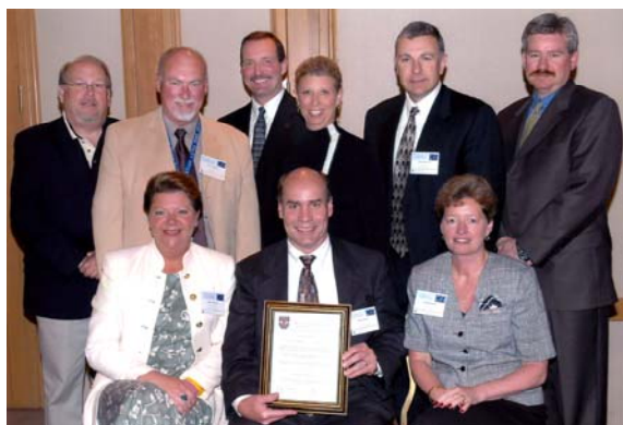
Sheboygan Police Department